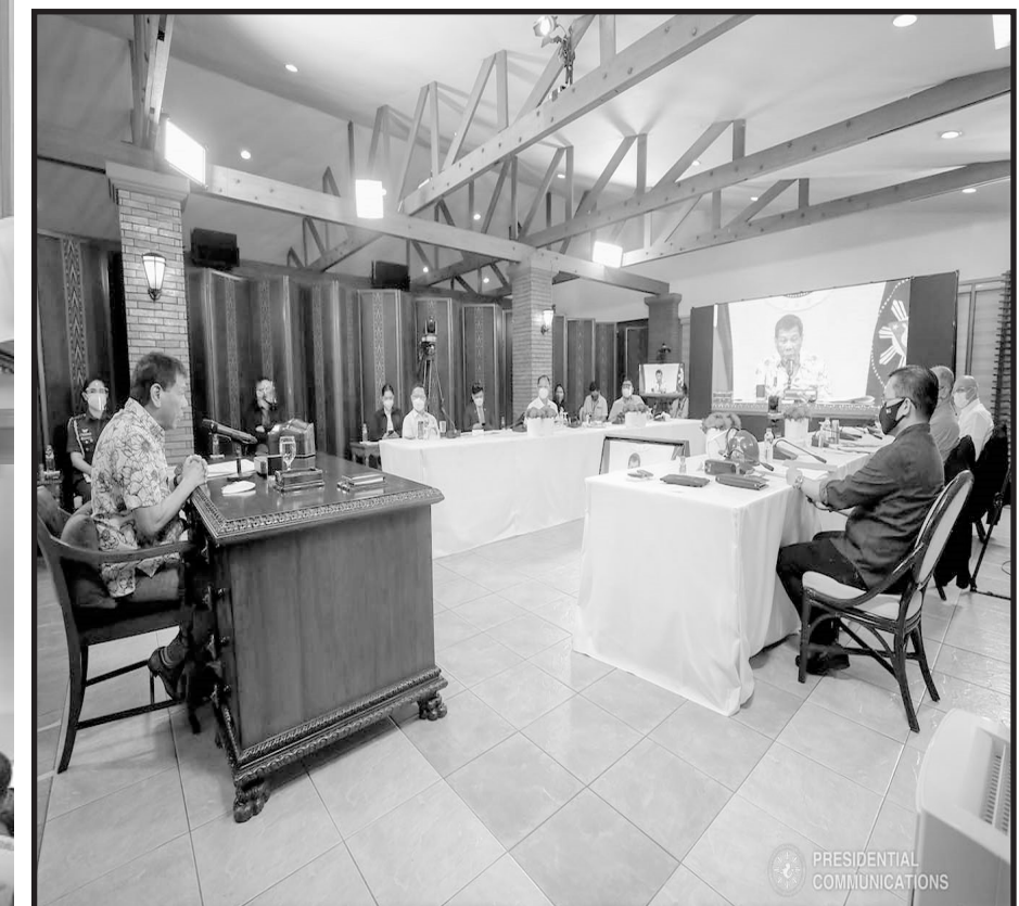
President Rodrigo Roa Duterte presides over a meeting with the Inter-Agency Task Force on the Emerging Infectious Diseases (IATF-EID) core members prior to his talk to the people at the Malacañang Golf (Malago) Clubhouse in Malacañang Park, Manila on January 13, 2021.